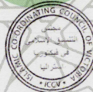
ICCV Organisation Seal